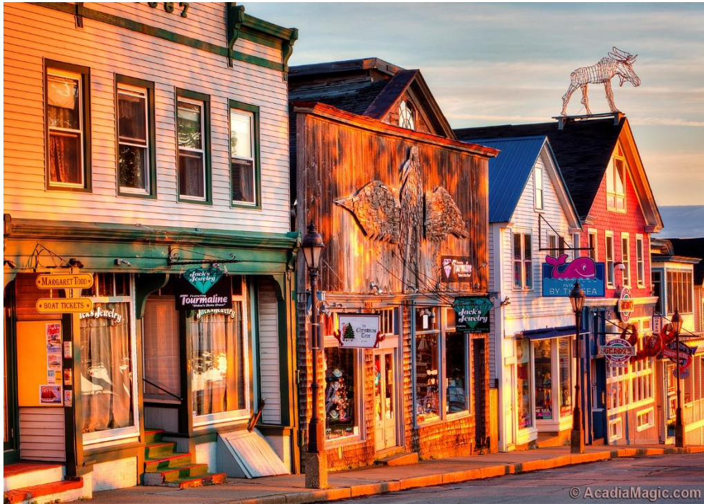
"MEET ME AT GEDDY'S," BAR HARBOR, MAINE (REPRINT COMPLIMENTS OF WWW.ACADIAMAGIC.COM)